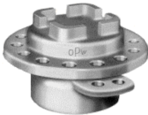
OPW #83 Fill Cap