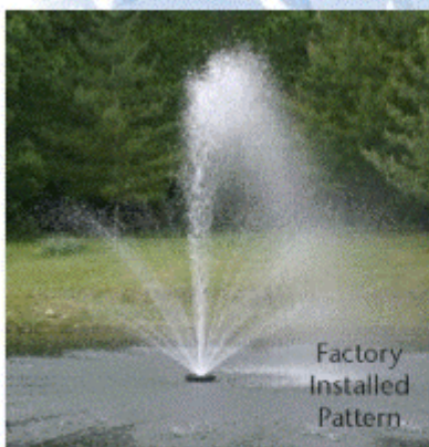
Water Lily - An eye-catching combination spray (15' @ 4,900 GPH or 82 GPM)