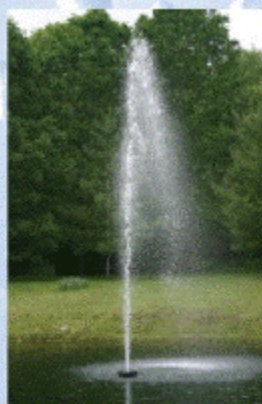
Sky Cannon - A dramatic single plume of water (15' @ 3,300 GPH or 55 GPM)