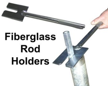
Fiberglass Rod Holders

Fiberglass Rod Holders are available in 5/8" and 3/4" sizes. These go under the rod coupling to support the rod while you put the next piece of rod onto the rod going into the well.